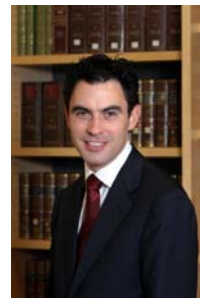
GAVIN JENNINGS, MLC Minister for Aboriginal Affairs

A handwritten signature in black ink, appearing to read 'Timothy Holding'.