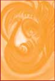
Phoenix Rising, 2005