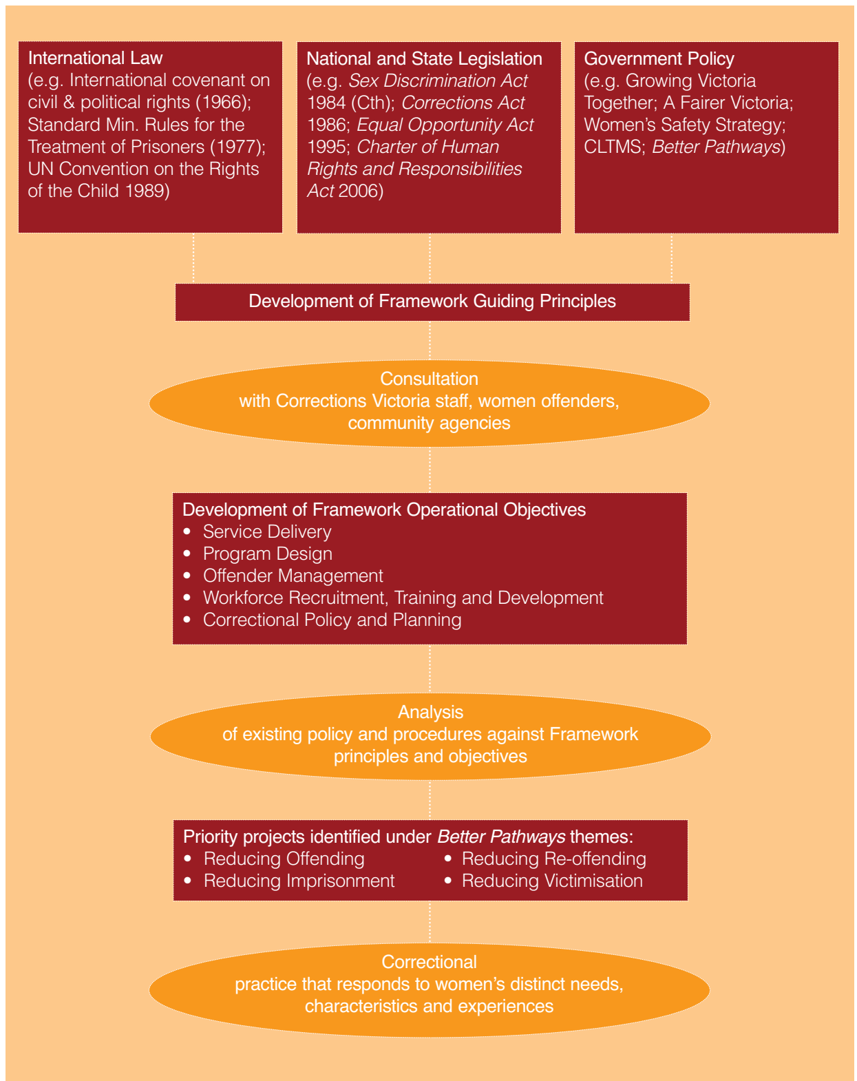
Figure 1 – Development of the Women’s Correctional Services Framework