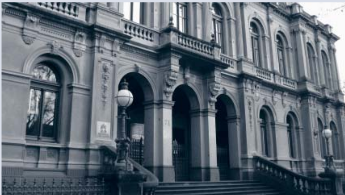
A $1.4 million upgrade of facilities at the Bendigo Law Courts has helped restore and maintain this heritage-listed building.