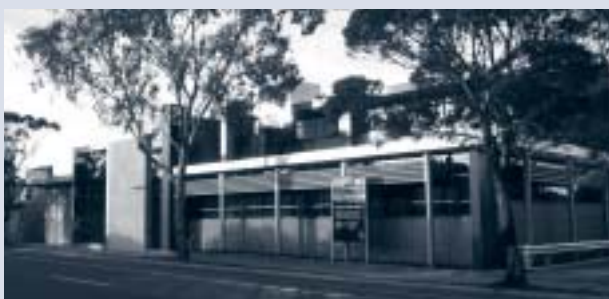
The $6.44 million Northcote Police Station is part of the State Government's $280 million program to improve and upgrade police stations across Victoria to house a record number of police.

Opportunities for police to co-locate with courts and/or emergency services are strongly monitored by the Department, consistent with the principles of joined-up Government. Wider policy initiatives, such as Melbourne 2030, growth corridors and local council priorities, are also influencing factors and are taken into account by Victoria Police in their Strategic Facilities Development Plan, which has been the basis of the Government's investment.